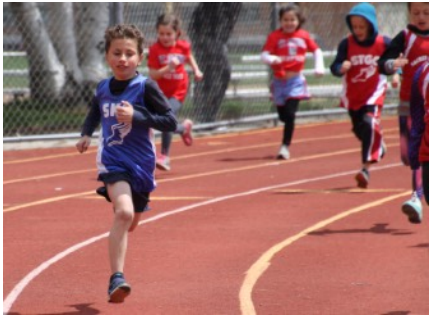
Above: Younger members of the SKS Track Team. Left: Coming down the stretch at a race. Congratulations to all of the kids for the great effort they put in this spring!

Congratulations to the SKS Track Team for a strong season! The kids worked hard and gave many key performances during the year. Here are some of the highlights: