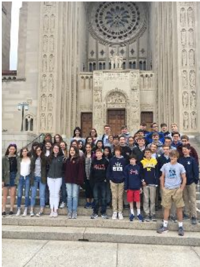
The Class of 2017 visiting the National Cathedral in May.

I am not sure about where I will end up in college next year, but I will be studying biology there with intentions to eventually go to medical school.